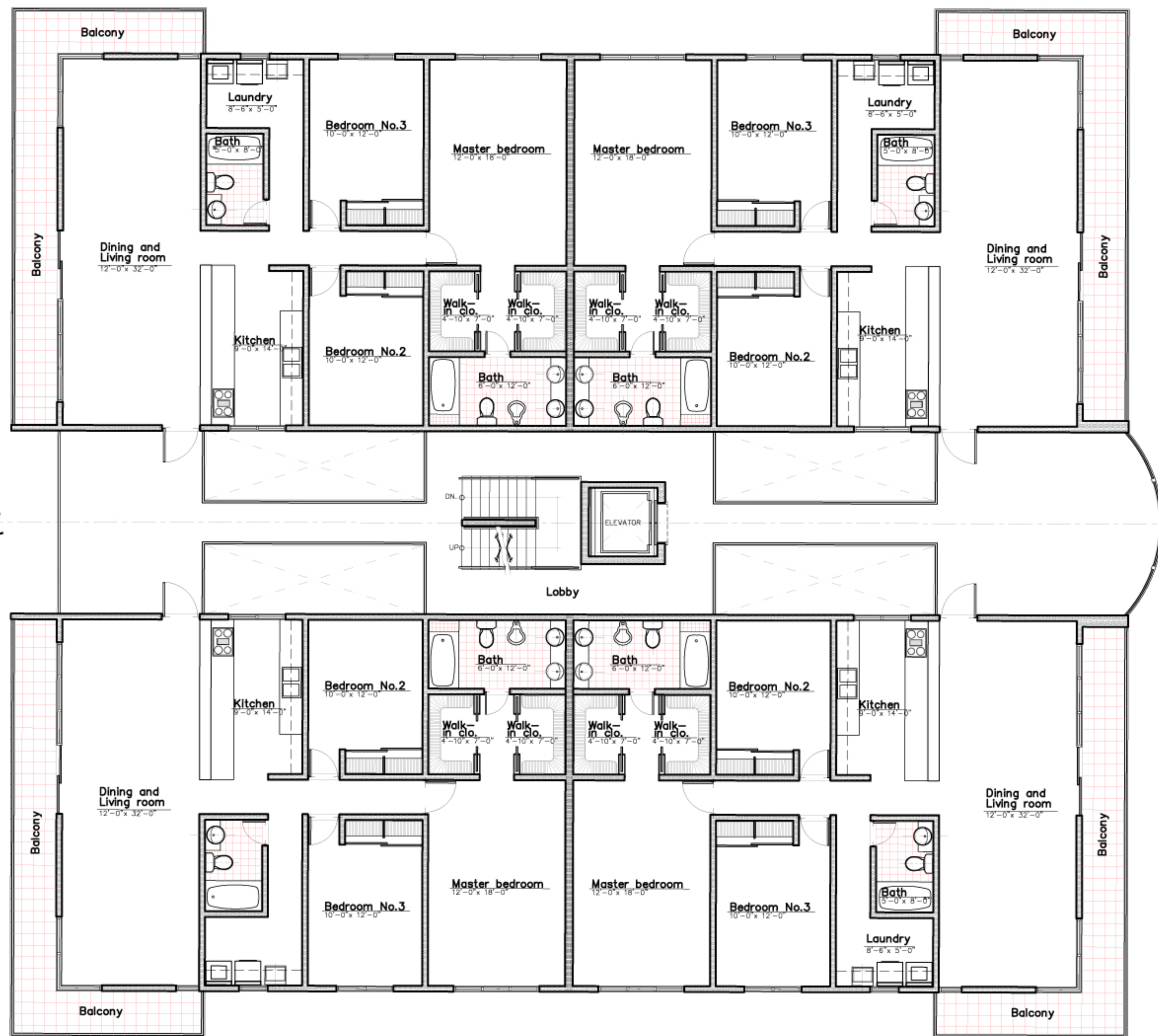
2nd. floor plan