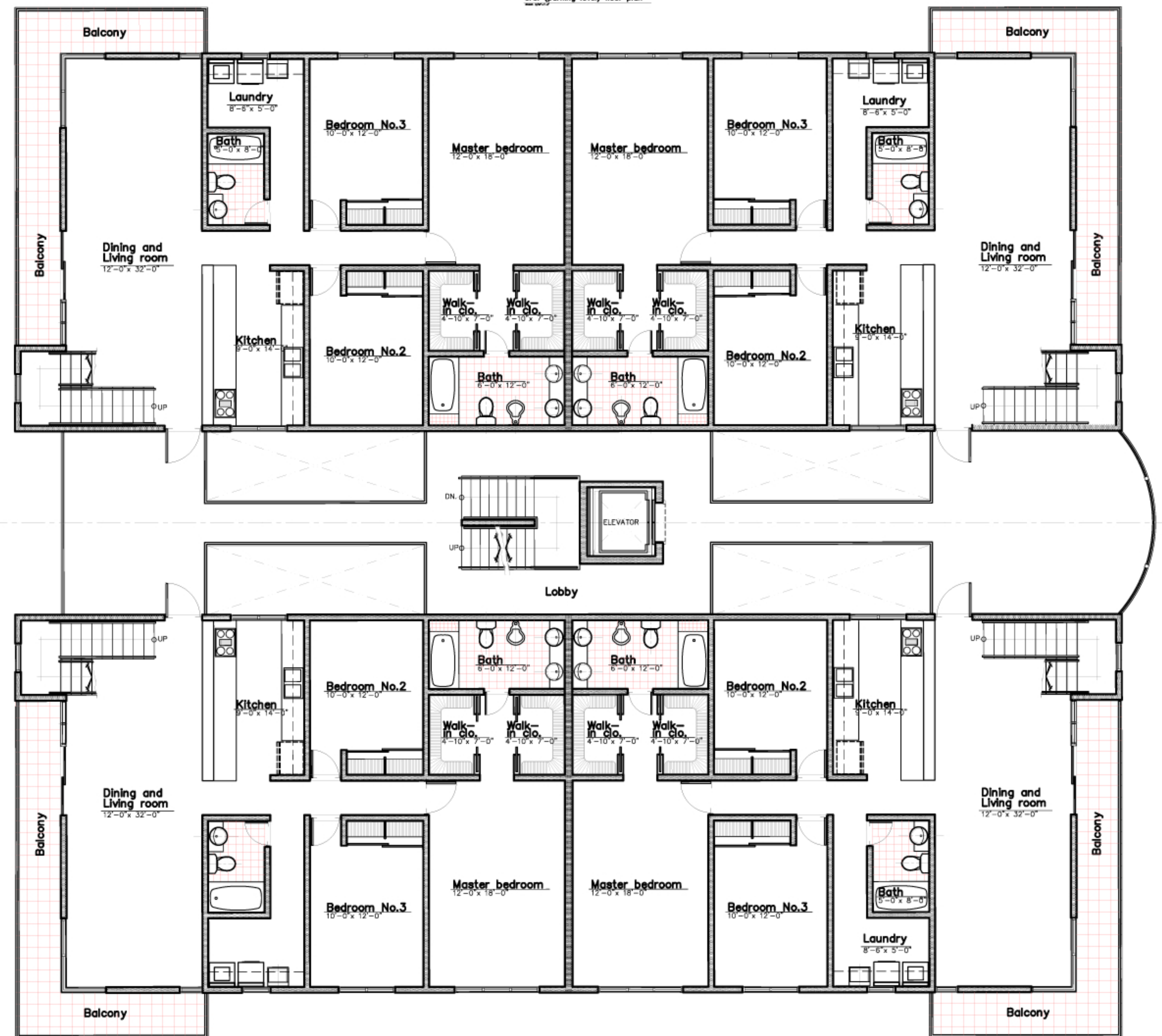
3rd. floor plan